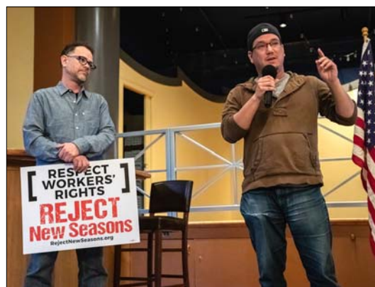
Representatives from UFCW Local 21 explain labor issues with the grocery chain New Seasons.