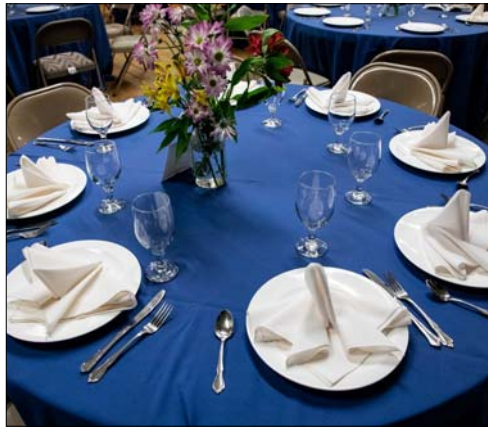
The tablecloth was Blue...of course!